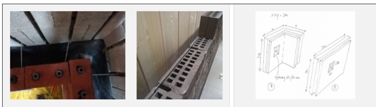
Figure 2. Left, the two compositions 1 & 2; right, the two set-up building experiments A & B.

The in-situ building experiment was conducted at the faculty. Framed within an existing floor, concrete columns and beams, two set-ups of cavity wall constructions of 9m 2 including a window (A, with a corner; B, without a corner) were designed, built and disassembled (see figure 2).