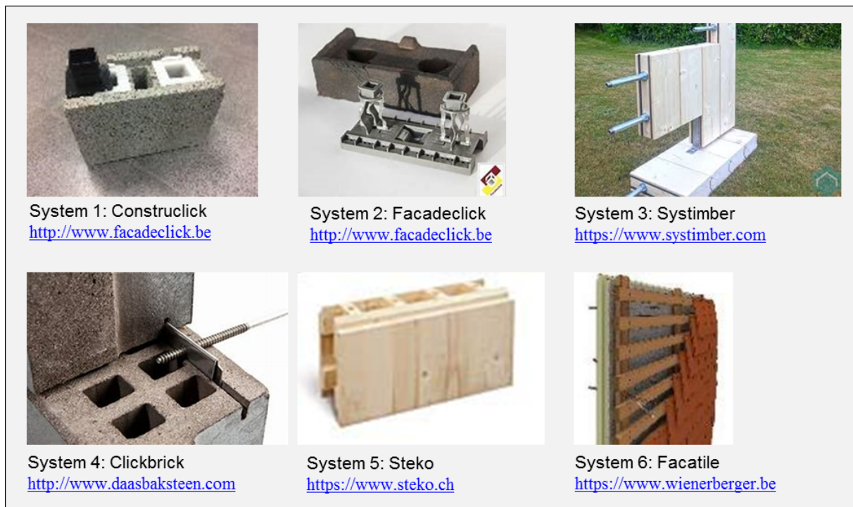
Figure 1. The six building systems selected.